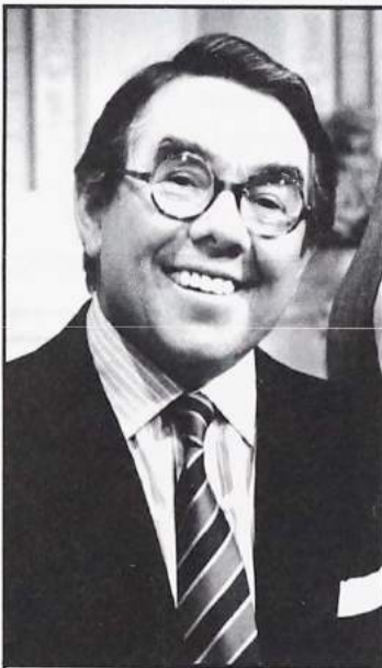
Ronnie Corbett in "Out of Order"