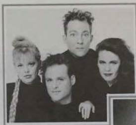
Pictured left to right: B52s Cindy Wilson, Keith Strickland, Fred Schneider (behind) and Kate Pierson.