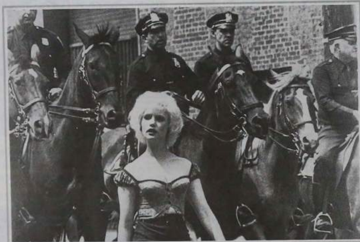
Jennifer Jason-Leigh as Tralala in a scene from LAST EXIT TO BROOKLYN - an opportunity for us to see what all the fuss was about in the '60s when our censors banned Hubert Selby's novel of the same name.

innovative in the early '60s seems to lack a connection to today's world. The film is a curiosity piece. But, for all those who wanted to read Last Exit To Brooklyn and were not allowed to by our censors, this film gives an idea of what all the fuss was about.