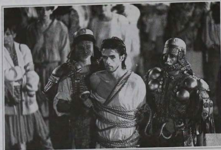
Lothaire Bluteau as Jesus in JESUS OF MONTREAL , Denys Arcand's 1989 Cannes Film festival Jury Prize winner, nominated for Best Foreign Film 1990 Academy Awards and winner of 12 Genie Awards (Canadian Oscars) 1990.

The film recreates with powerful imagery the mood of a specific place at a specific time. Performances by mostly non-"stars" are tops. However, what was shocking and