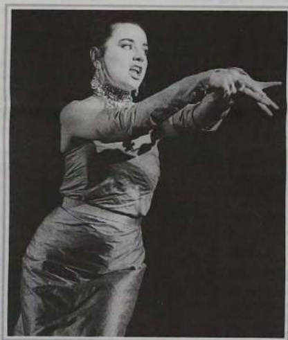
Right: TINA ARENA provides many of

the highlights in DYNAMITE . Tina's electrifying vocals can also be heard on her new single I NEED YOUR BODY , released through EMI.