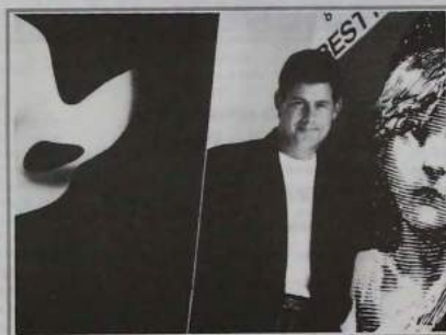
After Les Miserables and Phantom Of The Opera , Cameron Mackintosh is

In Act I we meet Seurat and his mistress