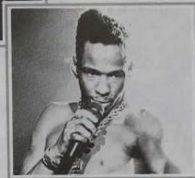
"Dance - Ya Know It" is the banner for funky Bobby Brown's 1990 tour. Tickets are

selling fast for Bobby's three concerts. Details below.