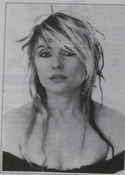
Deborah Harry looks like she means business here with her single "I Want That Man". She'll be performing live in New Zealand and Australia in

Adelaide: Thebarton Theatre Mar 17; Perth: Concert Hall Mar 19; Rouse Hill: Vinegar Hill Woolshed Mar 21; Brisbane: Mayne Hall Mar 22; Melbourne: Dallas Brooks Mar 23; Sydney: Town Hall Mar 24.