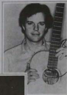
Above: Leo Kottke's music