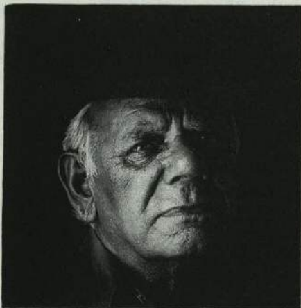
Playwright Jack Davis.

At the conclusion of this season, the company, which expanded to 22 for some plays, had acted in 90 performances, had been seen by 26,000 people and been employed for eight months.