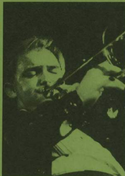
Trombonist, trumpeter and general jazz whizz James Morrison plays at Cabaret Cremorne at the Cremorne Theatre from 15-17 December.

Superb Australian Jazz musicians in the relaxed and informal atmosphere cabaret. Enjoy drinks and a light meal at tables downstairs next to the stars — or choose fixed seating in the balconies. Also special lunchtime concerts.