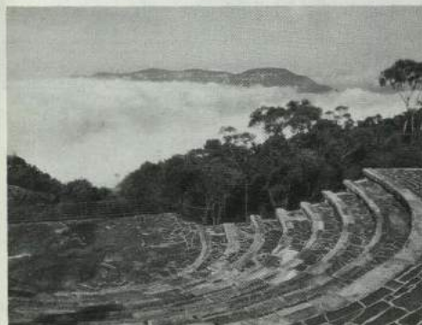
The Amphitheatre at Leura