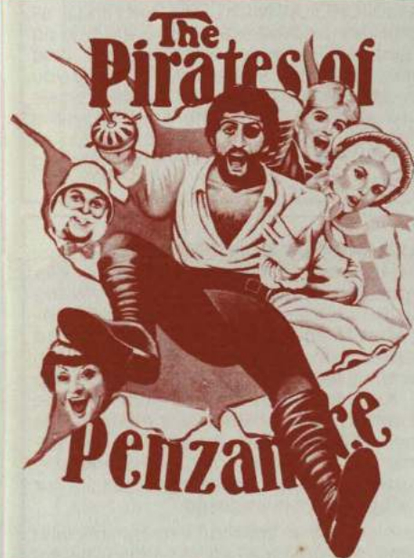
The New York Shakespeare Festival's Broadway production of Gilbert and Sulli-

van's THE PIRATES OF PENZANCE is to be staged in Australia by the Victoria State Opera, the Victorian Arts Centre Trust and the Australian Elizabethan Theatre Trust. Following a season at the new Melbourne Concert Hall it will open at Sydney's Regent Theatre in February.