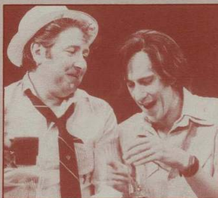
John Wood and Geoffrey Rush in TWELFTH NIGHT