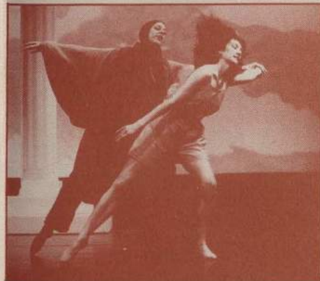
Human Veins Dance Theatre in a scene from THE SOUTH SEAS MUSEUM.