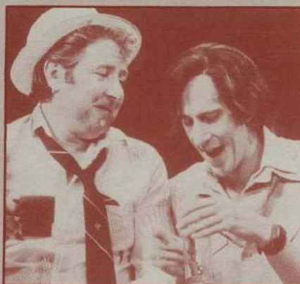
John Wood and Geoffrey Rush in TWELFTH NIGHT