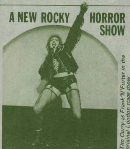
Tim Curry as Frank N. Furter in the original London stage show