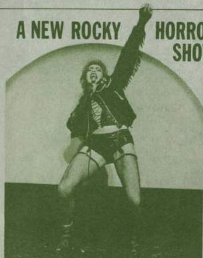
Tim Curry as Frank 'N' Furter in the original London stage show