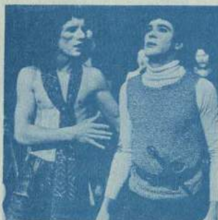
The Tempest production

The Shopfront Theatre Touring Company will end its highly successful year by performing a two week season at the Cell Block Theatre, East Sydney Tech, Darlinghurst from Dec 9—20. They will be performing Shakespeare's THE TEMPEST and a group created play CHILDMYTH .