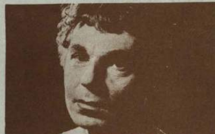
Derek Jacobi in I CLAUDIUS

THE GRAND TOUR is a joyous ensemble of music, songs and words about the reflections and experiences of such famous travellers to the Continent as Shelley, James Boswell and Samuel Johnson.