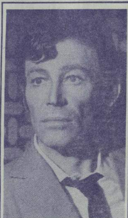
PETER O'TOOLE LUNCHEON