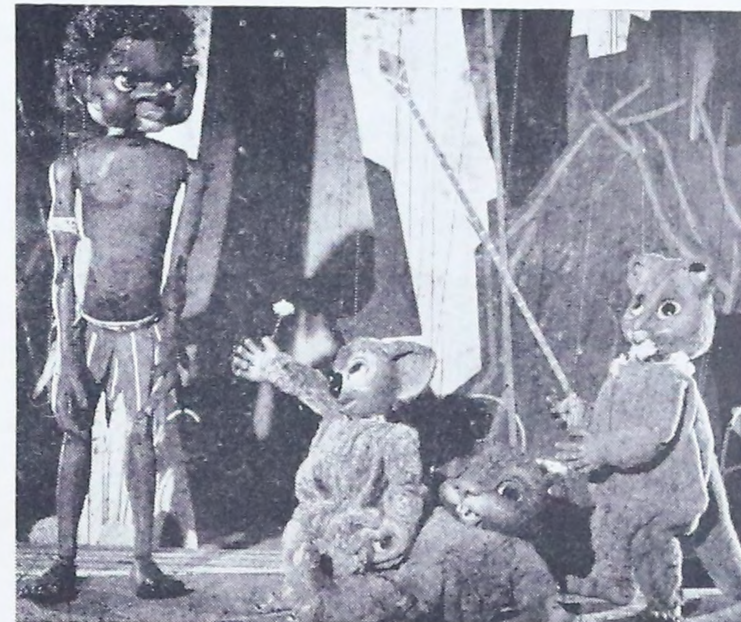
Krump: "We've never met a boy before."