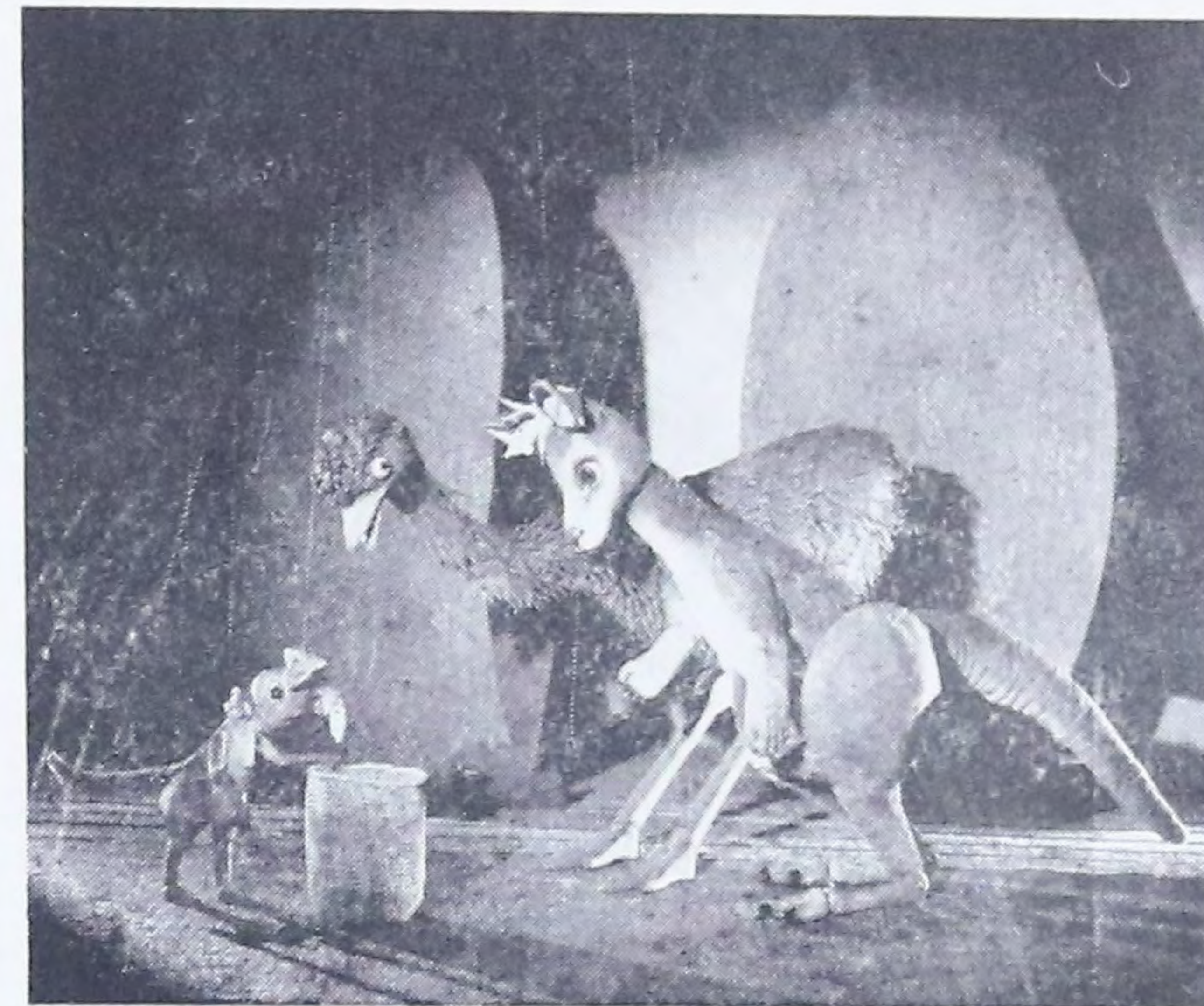
Mrs. Kangaroo: "Don't touch it, Joseph; it belongs to Bindi."

85 New South Head Road, Edgecliff, SYDNEY