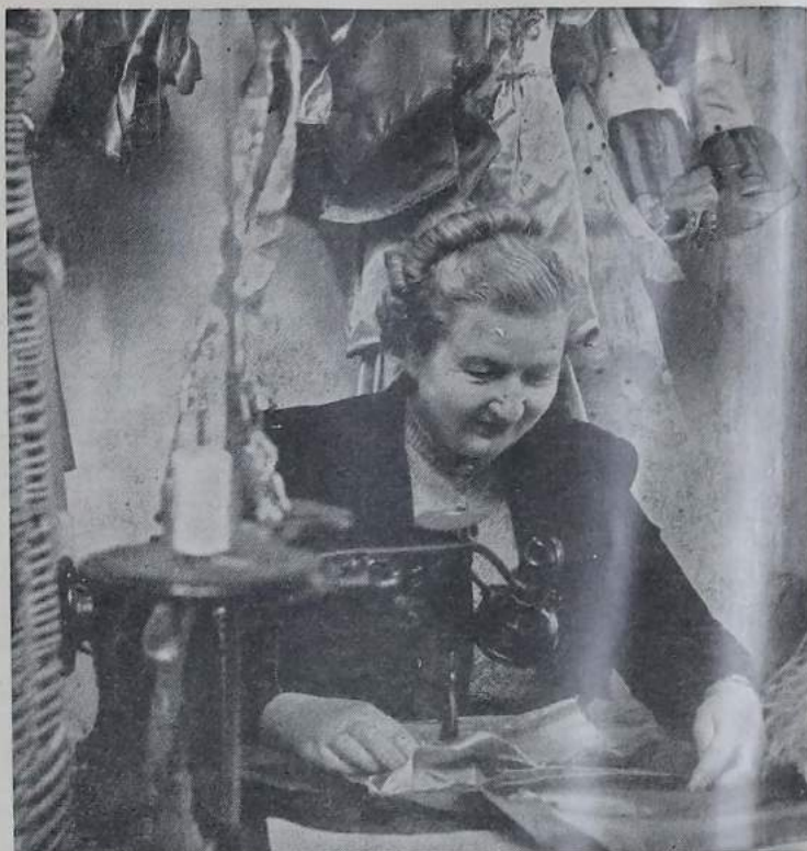
A Wardrobe Mistress has hundreds of costumes in her care.