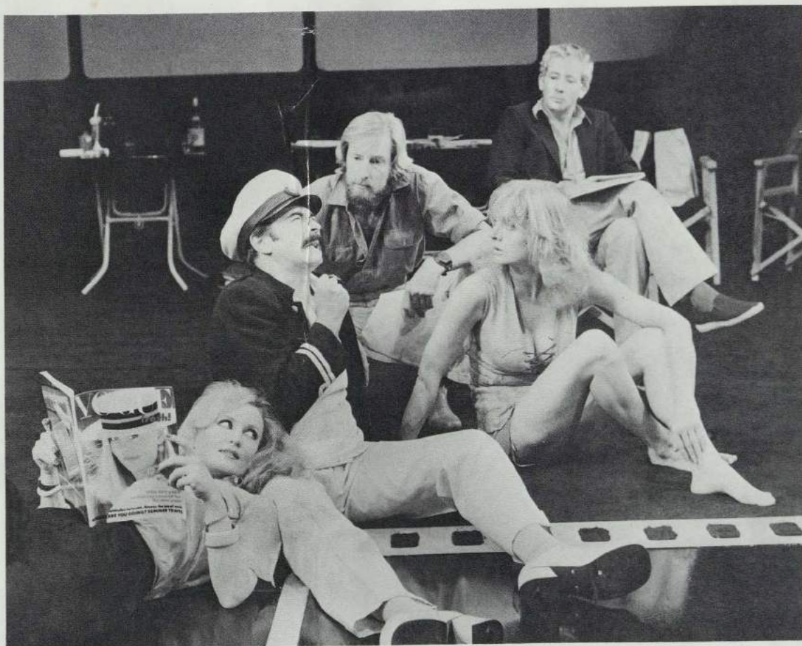
Some of the actors and actresses in a scene from the Nimrod Theatre's production of David Williamson's play 'Celluloid Heroes'. This played at the Theatre Royal Sydney before being reproduced to tour to Adelaide and Perth.